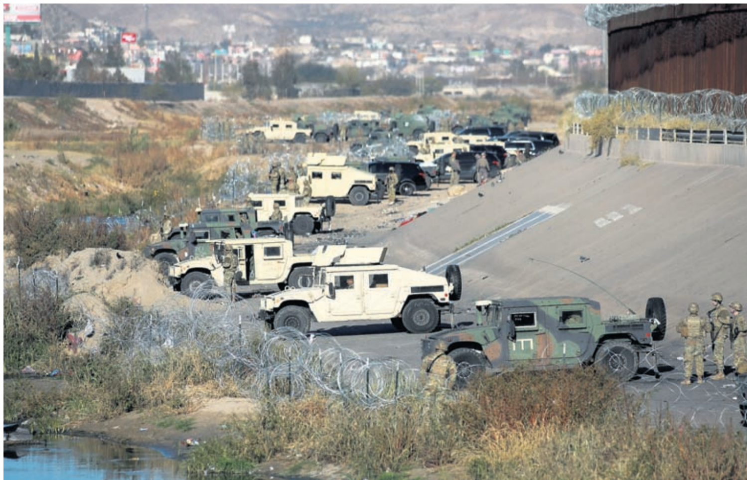
U.S. military guard El Paso's border with Mexico, seen from Ciudad Juárez, Mexico, Tuesday, Dec. 20, 2022.

In El Paso, Democratic Mayor Oscar Leeser warned that shelters across the border in Ciudad Juárez are packed to capacity with an estimated 20,000 migrants who are prepared to cross into the U.S.